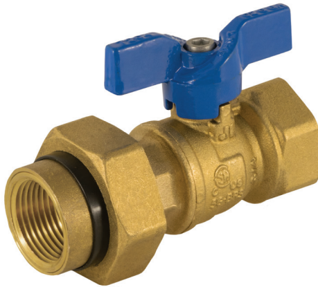
T-204DU - FIP DU x FIP